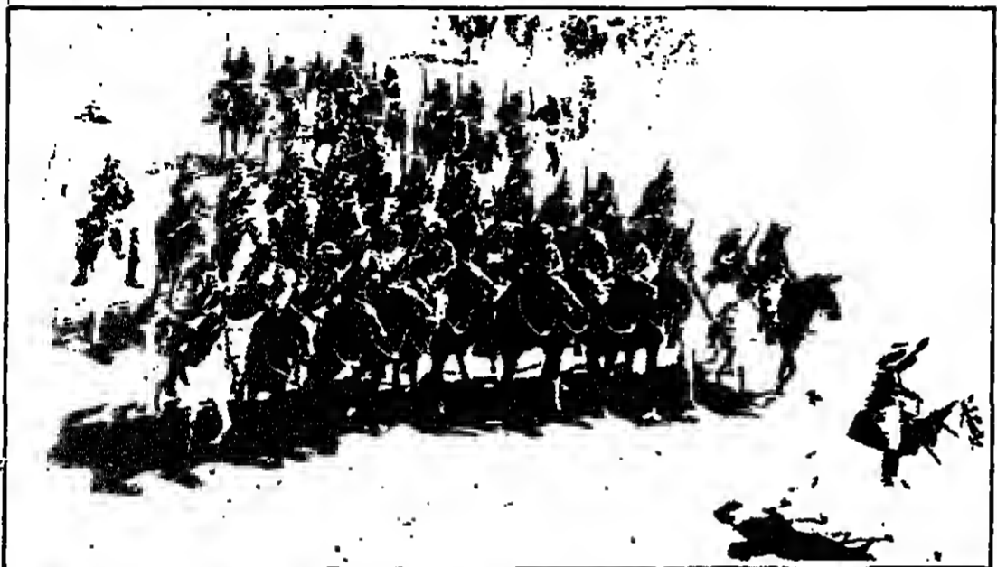
A cavalry company of the Arab Legion, led by Wasfi Mirza, leaves camp to embark on a desert patrol in 1940.